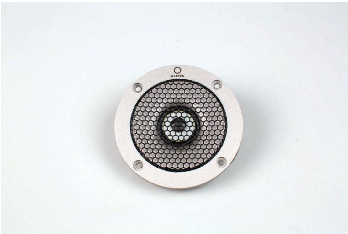
Tweeter with a profile similar to a tube, with a protective mesh and an "overlay" on the top of the membrane.

where more money is involved, no self-respecting producer will try to prey on audiophile naivety. Anyway, this naivety has long been steeped in such suspicion that it probably ceased to exist.