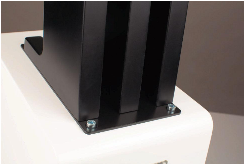
The speakers can be screwed to the stands.

For monitors, Duo Marten produces special stands. And they reached the test. They look very nice, and the tilt to the rear visually matches the slant of the housing walls. The stands are mounted on cones, and the speakers to the platforms can be screwed on with screws. The construction turns out to be relatively light. I do not know what material it was made of, but it is definitely not metal. A pair of coasters was valued at about PLN 3800.