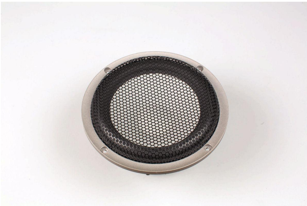
Woofer with ceramic diaphragm and wide suspension.

where more money is involved, no self-respecting producer will try to prey on audiophile naivety. Anyway, this naivety has long been steeped in such suspicion that it probably ceased to exist.