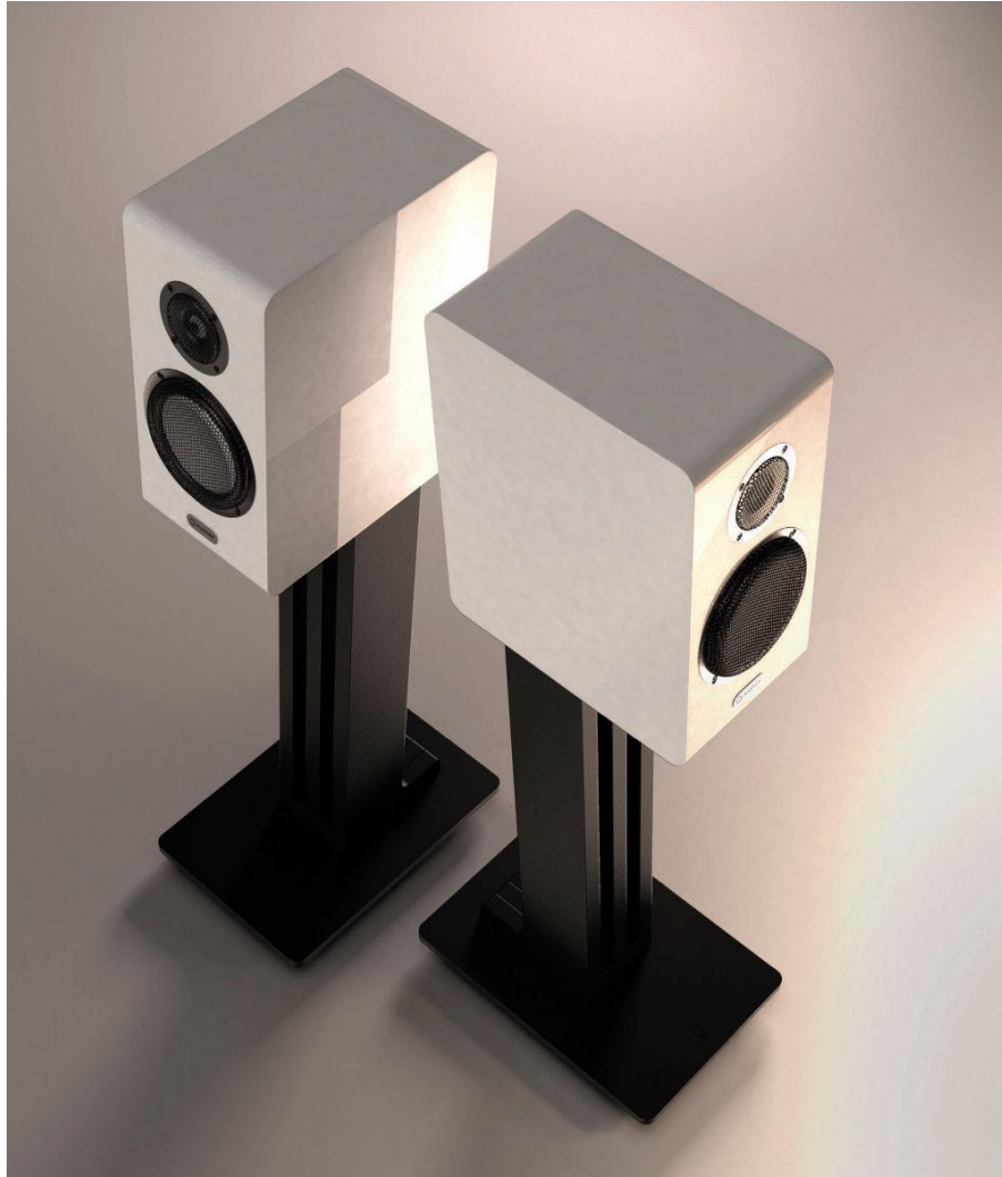
View from above.

Martena's greatest asset is hidden beneath the surface of time. Only around the third evening listening did I begin to appreciate the value of the upper midrange. I'm not saying that you can't find out about it earlier - a lot will probably depend on the repertoire and electronics. After we have absorbed the right sonic message, we will be able to simply sink into the music, and that's what it's all about.