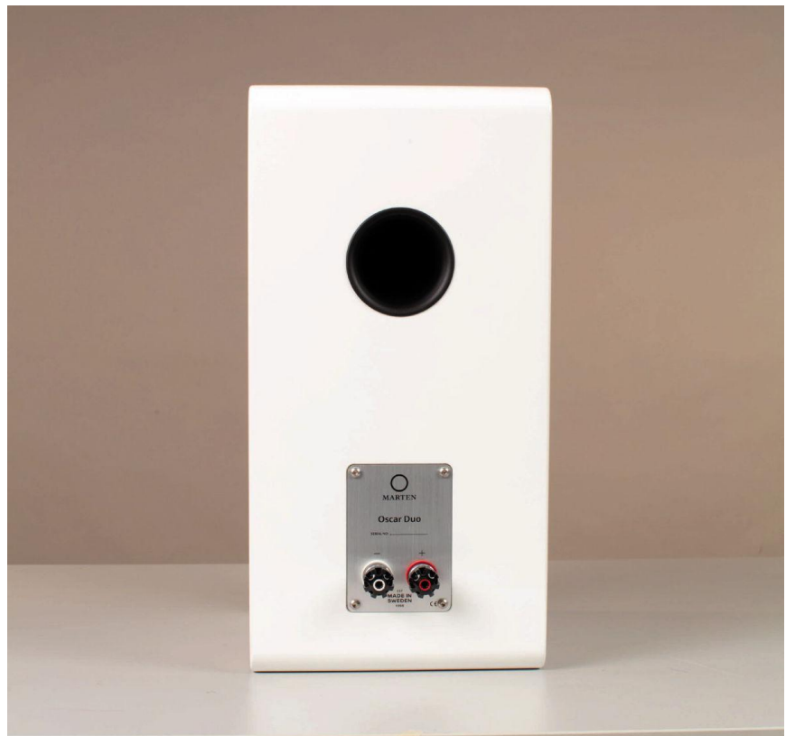
Two-way, rear -ventilated system .

The upper midrange makes the sound clear and transparent. Despite not too restrictive bass control and the general tendency to round the contours, we get a clear sound,